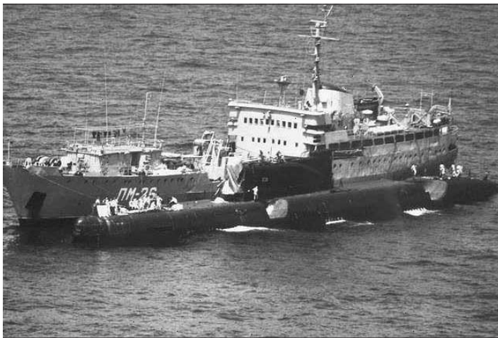
A Juliett-class submarine being repaired at sea

This experiment in naval aviation, however innovative, was never intended to offset U.S. air superiority. The Ka-25 helicopter, of which the Moskva and its sister ship Leningrad could accommodate a maximum of eighteen each, was slower and of shorter range and endurance than its U.S. counterparts, and an easy target for NATO fighters. One hypothesis is that the Moskva had been originally designed to extend the range of shore-based ASW helicopters engaged in anti-Polaris operations in the Barents Sea. In the Mediterranean, however, without proper support facilities, the ship proved ineffective, “far too small and vulnerable for operating . . . on the far side of the Straits.” 53 The many deficiencies in the Moskva's design—ranging from inadequate length and poor seakeeping characteristics in rough weather to an aircraft complement too small for its intended ASW purpose—accelerated the ship's replacement by the first full-size Soviet carrier, the Kiev (pr. 1143), which first operated in the Mediterranean in 1976. 54